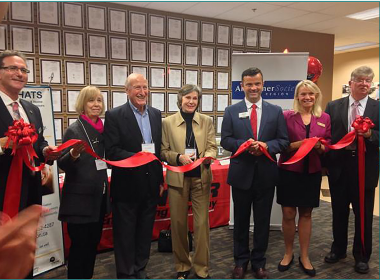
Grand Opening of the Community Healthcare Hub

To support the health and well-being of seniors and caregivers at home and in the community.